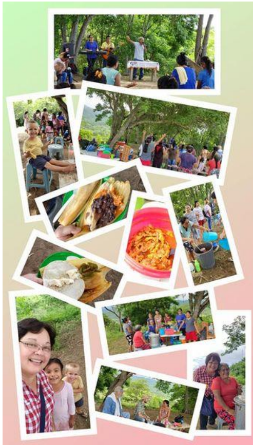
Sunday Worship in San Martin, Oaxaca, Mex.

I miss my family so much. I miss home! And, of course, I miss my doggy Dori, but there is nowhere else I wanted to be right now, but here. Being here is an answered prayer. I praise God that He has fulfilled His calling in my life. Living here in Mexico feels like being in my birth country, in the Philippines. Beautiful and the climate is very much the same. Hot and humid! The Mexican people are very warm, kind, loving, and compassionate like the Filipinos. I'm still in the stage where I struggle to convey what I wanted to say, but I find the people very patient trying to understand me and very helpful to get me to express what I wanted to say. A lot of times, I get so embarrassed and frustrated when I think I know the word and couldn't complete my sentence in Spanish, or I would say it incorrectly. It's a very humbling experienced. However, I can tell that the people I'm encountering with are happy and appreciative that I am eager to learn their language. Through this experiences, being here alone as a single woman and couldn't speak the language in a foreign land, I believe that God is deepening my walk with Him. God is teaching me His ways. He is teaching me patience, courage, and humility. Gently, He is stripping me off of the things that is not of Him. He is still shaping me, refining me to what He wants me to be.