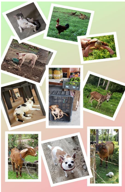
Joy in the little things

In my quiet times, I cry out to Him. I feel that I am struggling and overwhelmed, but I serve a very loving God that in the midst of all, He brings joy in my heart in my daily walk with Him; from learning the language,