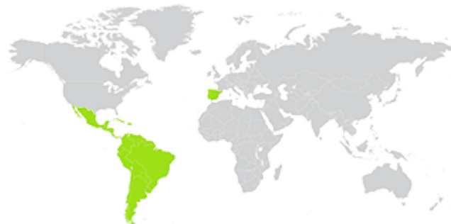
IBEROAMERICA AND THE CARIBBEAN