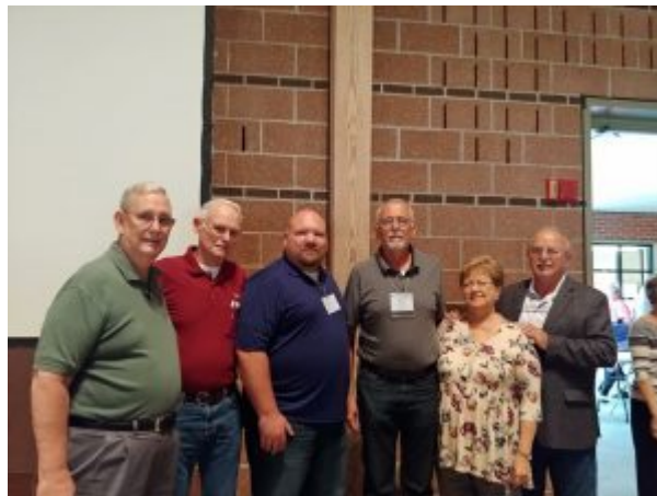
Brothers from other mothers from Highland—seriously, I feel like I've always known them!

Many of these people have been with us from the very beginning, and they continue to pray and give and love us. We love them! Imagine, seven years ago, we didn't know any of them—nor did we know our beloved friends across Liberia, Hungary and Serbia who they've sent us to love.