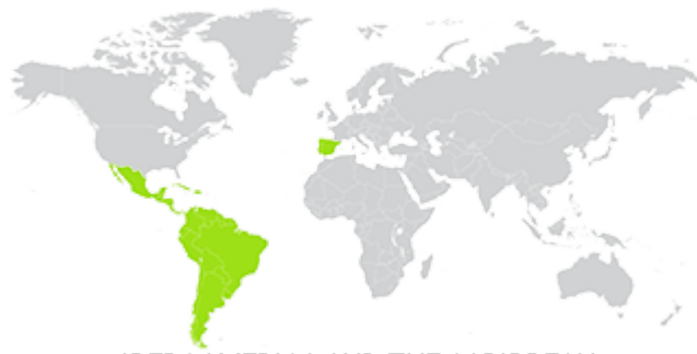
IBEROAMERICA AND THE CARIBBEAN