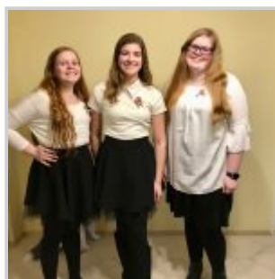
The girls dressed for a school holiday.