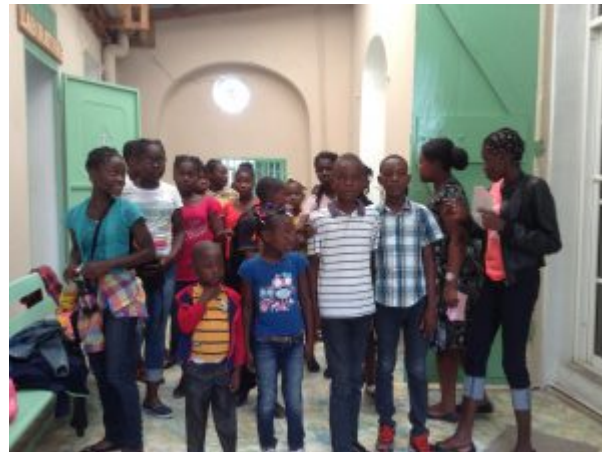
Children arrive at clinic