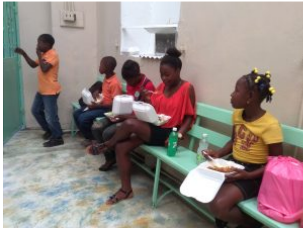
Children get lunch