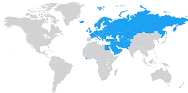
EUROPE, THE MIDDLE EAST AND LIBERIA