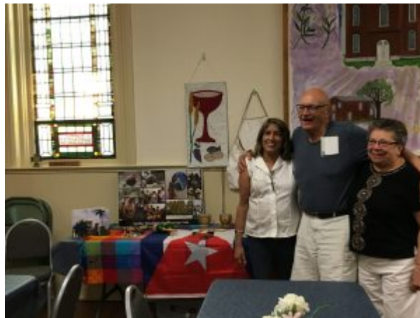
United Baptist Church Saco, ME