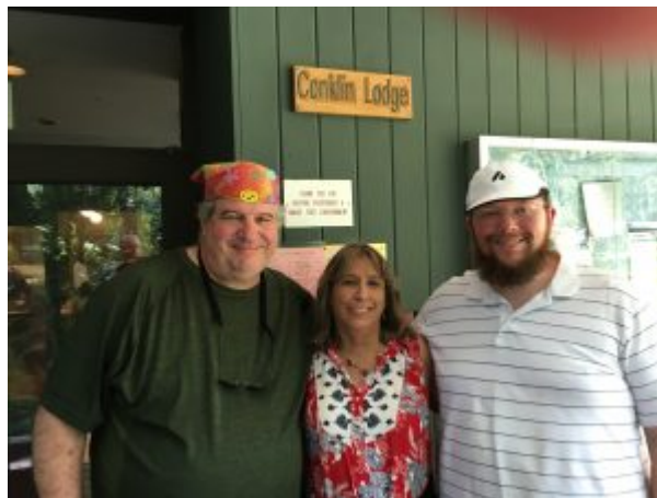
Camp Pathfinder, NYS

Our theme for the offering this year is "You are the salt of the earth". The salt and light verses come right after the beatitudes which begin with the words Blessed are... In Spanish, those words are translated as dichosos serán which means happy are. Happy are the merciful, the meek, the peacemakers, those who hunger and thirst for righteousness, those who are pure in heart, those who are persecuted, the poor in spirit. Basically, happy are those that follow Jesus and live in a Christlike manner.