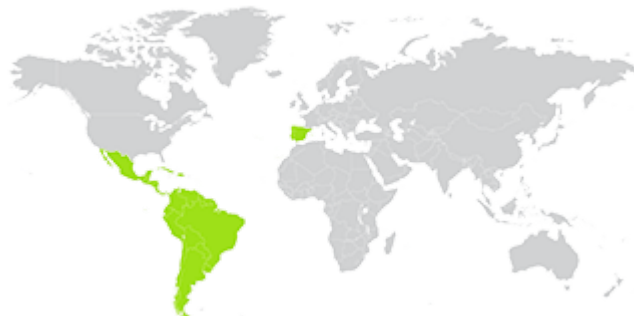
IBEROAMERICA AND THE CARIBBEAN