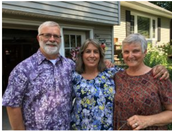
From FBC Hamilton, NY