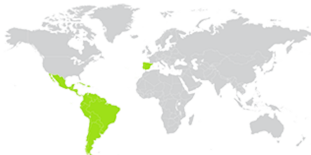
IBEROAMERICA AND THE CARIBBEAN