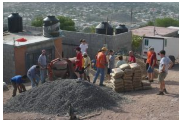
2005 Mission Team to La Paz, Mexico