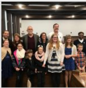
our IM family in Hungary