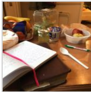
a quiet moment of thankfulness