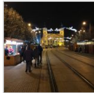
Debrecen at night

Hungarian is a difficult language for English speakers, but we learn more every day. Our family began working with a language tutor last week and we adults will begin classes at the university in mid-January. Our Hungarian speaking friends are gracious to help us and strangers are patient with us. Learning Hungarian will be a challenge, so we treasure your prayers. Please also pray that our children will thrive in this environment. The Lord is already providing for their spiritual development through a welcoming youth group. The kids are making friends and happy about beginning school next week.