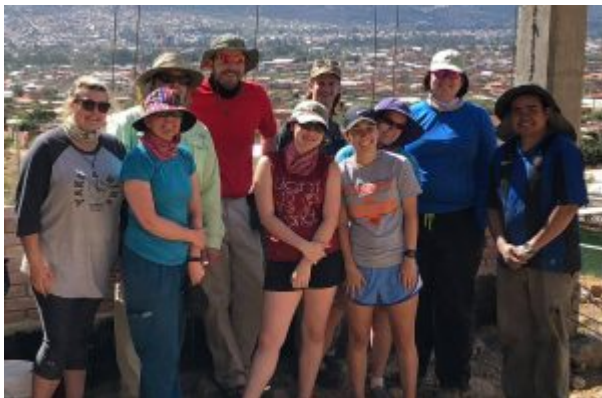
At the worksite with Parkway Baptist Church from Duluth, GA

“On June 7 th , we arrived in Cochabamba with the first team from Duluth, Georgia. They were a small team of 7 people, so getting to know them was quick and easy. I had the opportunity to help with one of the dental clinics in the community that we were building the church in that week. The dental clinic was a new and incredible experience. The tools that they have to be able to provide dental care to the communities was astounding to me. I enjoyed being able to see that and also spend time getting to know the dentist and patients.