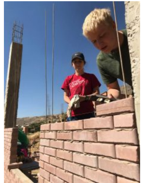
Getting that wall built!

“I learned so many things during the month that I was there. I learned to be flexible with plans because things will always change. Being flexible is one of the most important things to remember while serving in a cross-cultural setting. I also learned how important a community is and how big of an impact they can make in someone’s life. I experienced the hardship of working alongside those who don’t speak the same language as I do. It was the most fun and the most difficult part of the whole trip. It was great learning things in Spanish while teaching them some English. It was difficult because it was tough not being able to understand everything that they were saying to me and always needing to have someone translate for me.