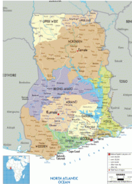
Map of Ghana