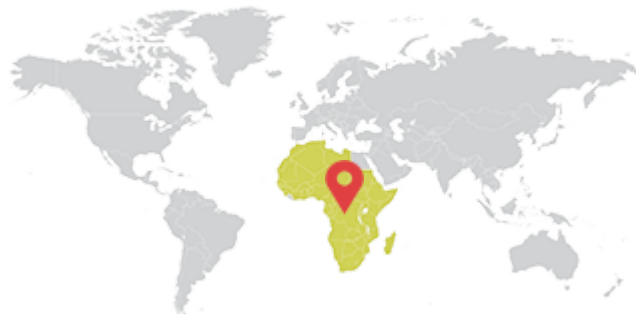
DEMOCRATIC REPUBLIC OF THE CONGO