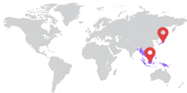
JAPAN, SOUTHEAST ASIA