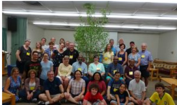
CFM Class of 2018

Our key verse of the week came from Colossians 2:6-7. “Rooted and built up in Christ” is a phrase imbedded in those two verses. At the end of the week, we wanted to illustrate this in a tangible way. So, as CFM’s class of 2018, we purchased a sapling to plant on the grounds of the Green Lake Conference Center where we were meeting. It was a vivid reminder that we are rooted in Christ, rooted in community, and rooted in partnerships around the world. Our intent was to close worship by planting the tree in the ground. But a thunderstorm rolled in, and the planting was deferred to the next afternoon. It felt like what we all experience each day on the field. Plans go awry. Unexpected events and people interrupt our agendas. Storms can catch us off guard. But when we allow ourselves to fall into the mystery of the Living God, to let grace-rain soak all the way to our roots, then we rise up strong, we rise up brave, we rise up resilient.