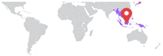
JAPAN, SOUTHEAST ASIA

Your help is needed in Thailand! Did you know that there are 30 Christian Thai schools connected to International Ministries through the Church of Christ in Thailand and the Christian Service Foundation? Additionally, we have a relationship with the Chiang Rai International Christian School. What do they all have in common? They need teachers! I was privileged to meet with the directors and managers of these schools over a 5-day educational consultation in Chiang Mai, Thailand. It was an important time of mutual sharing and discernment as together we looked at the meaning of the partnership.