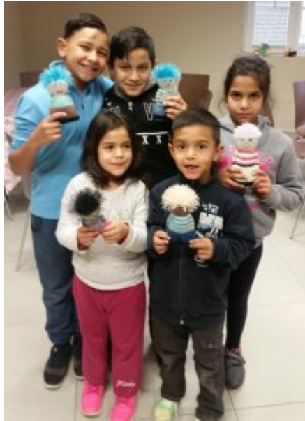
Peace Pals sent by Brewster Baptist Church in Massachusetts

Pray that these kids will keep on asking questions and will find meaning in each of the stories of the Bible that they hear, and that they will ultimately be led to walk with Him.